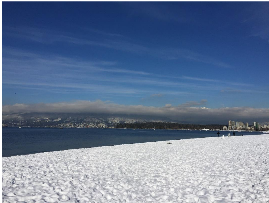
And Vancouver sparkled