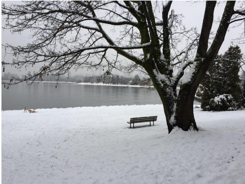
On the way to the club