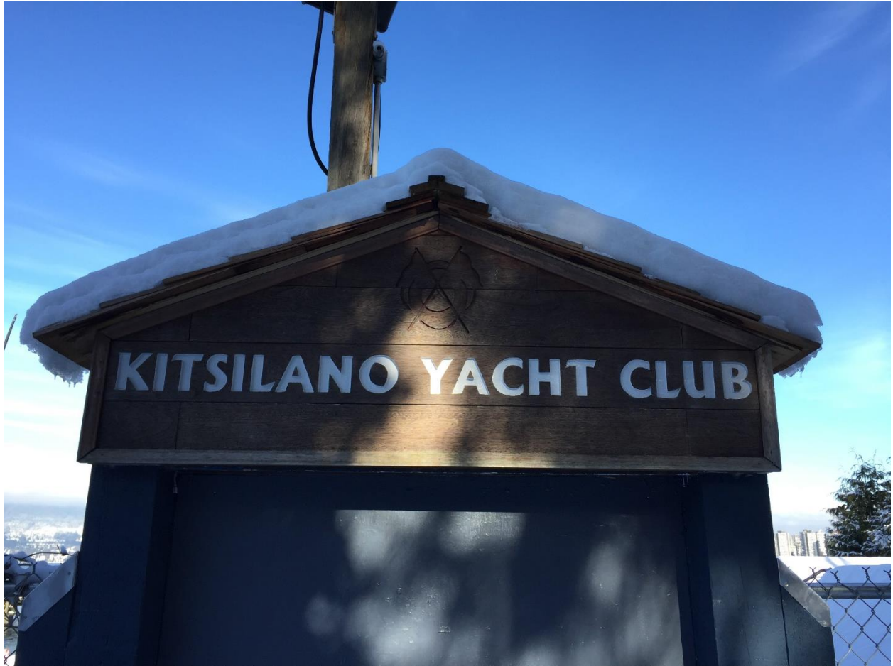
The sun did eventually come out