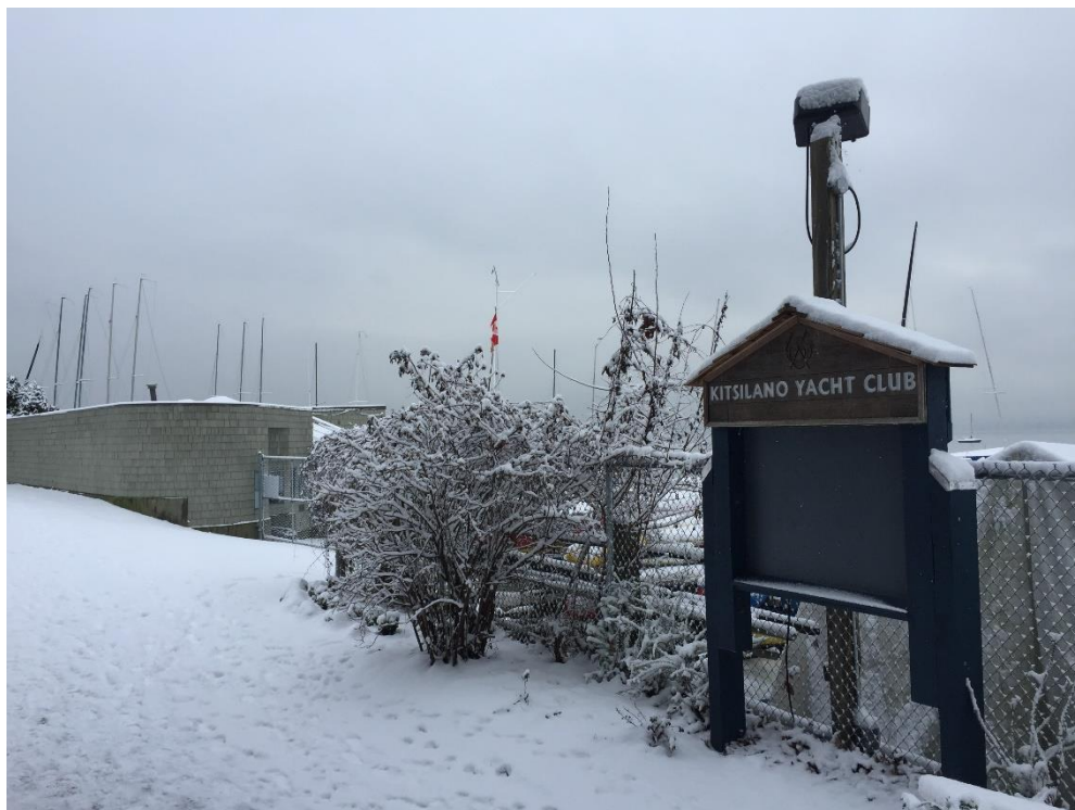
The path to the club