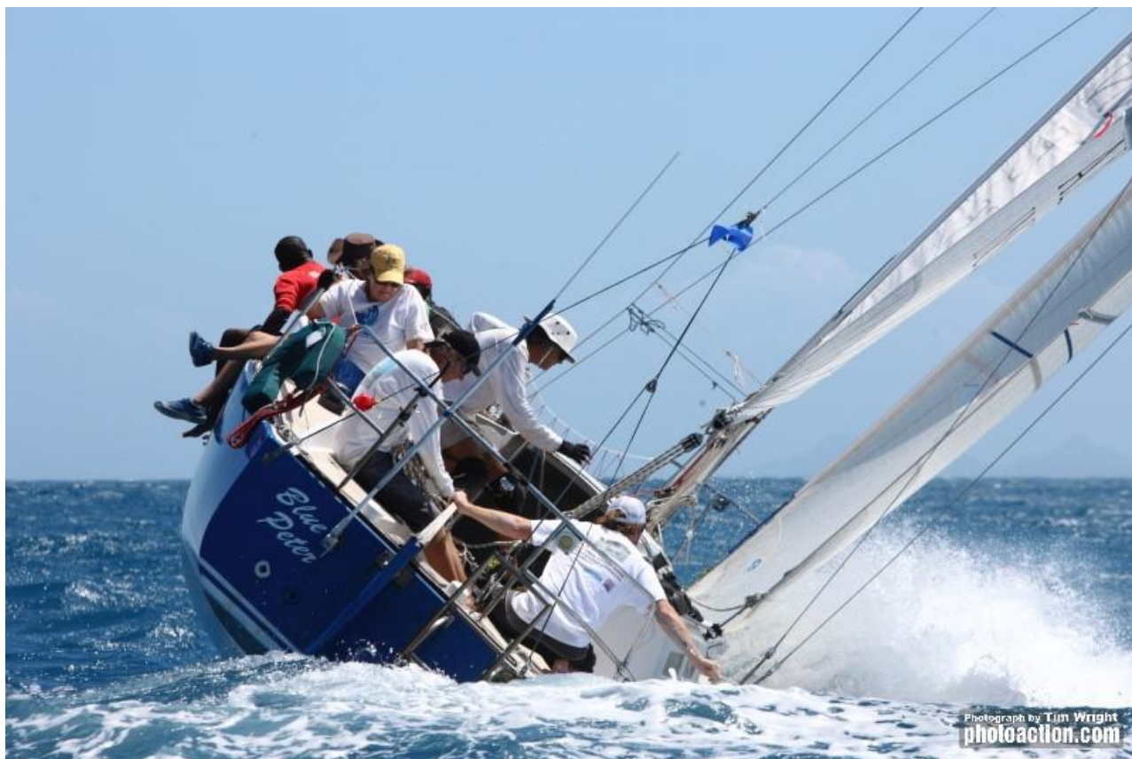
About to tack